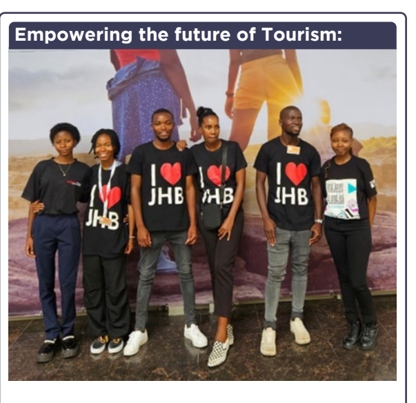
IIE Rosebank College graduates and students shine at Meetings Africa

IE Rosebank College Career Services department in Braamfontein Campus partnered with Zimasa Travel and South African Tourism to send students to the prestigious Meetings Africa event. The event, held from February 27th to 29th, 2024, aimed to showcase exhibitors' offerings to international and local buyers, African associations, and corporate planners.