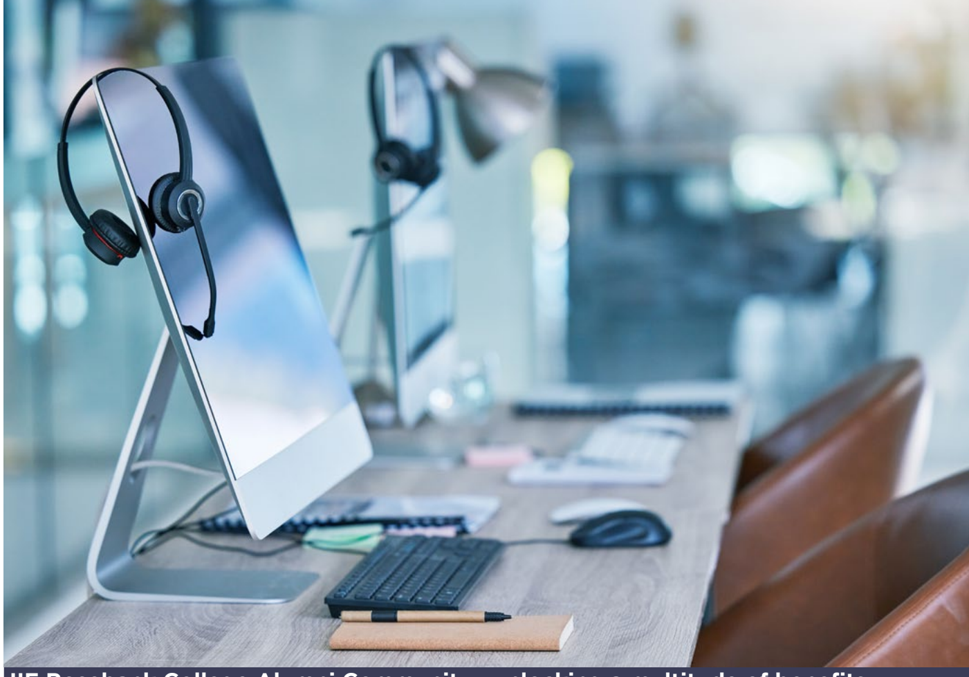
IIE Rosebank College Alumni Community - unlocking a multitude of benefits

Welcome to the IIE Rosebank College Alumni Community! As a proud IIE Rosebank College Alumni, you are automatically a valued member of our vibrant and supportive network. This newsletter marks the start of our shared alumni journey, celebrating our achievements and fostering a sense of community. Draw inspiration from your fellow graduates and continue to pursue greatness.